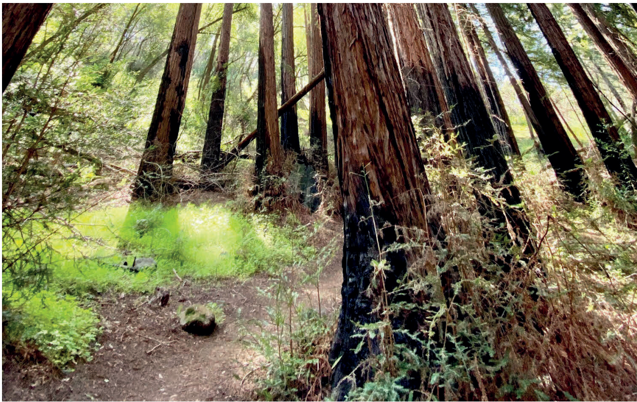
Redwood grove on hiking trails at Bartholomew Park. Bark shows charring from 2017 wildfires.

Clearly, though, the park's highest and best calling is the gorgeous picnic grounds — Antonia's Garden — with its tables under the oaks and views of vineyards, ponds and the Valley beyond. One could also have a really old-fashioned picnic and spread out a blanket on the lawn instead. As a bonus the park's bathrooms are really quite nice (something that can't be said for all local parks).