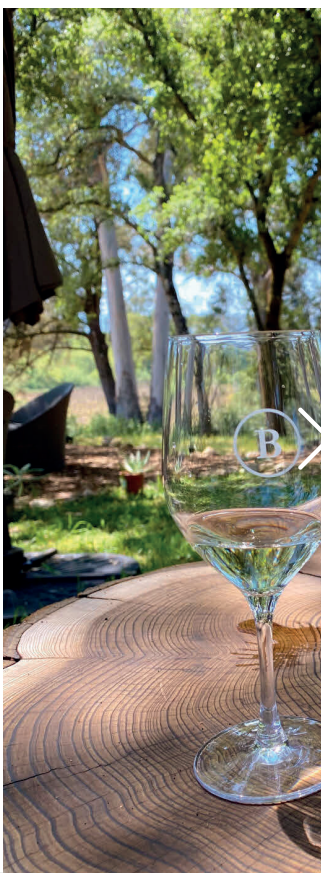
SLIDE 1 OF 3 Tables in Antonia's Garden picnic grove in Bartholomew Park, Sonoma.

JULIE VADER SPECIAL TO THE INDEX-TRIBUNE June 7, 2021, 5:00PM | Updated 7 hours ago